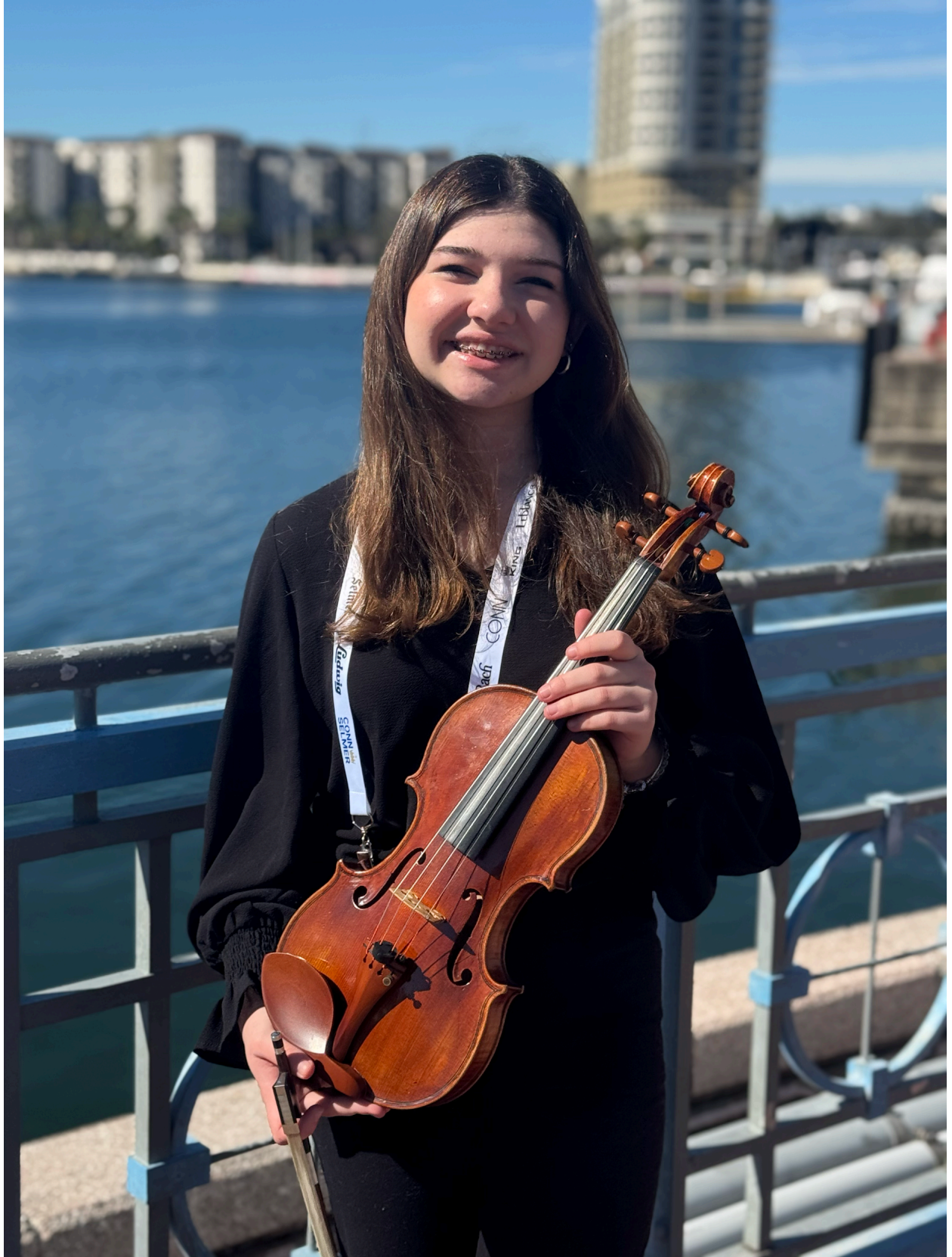
FYO Principal Orchestra member