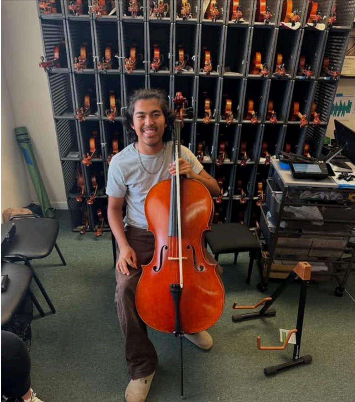
Winner of the 2025 Equity Arc Scholarship chose to apply his scholarship award to the purchase of a cello and bow at Barnesviolins